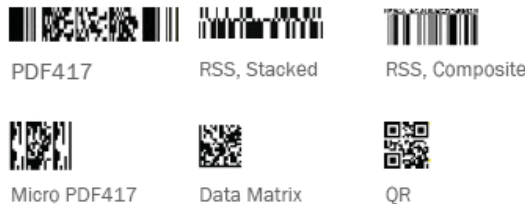
Figure 2: Examples of bar codes and symbols

Some manufacturing environments use a workaround by mounting the reader after applying a special anti-static spray for protection. There are two problems with this attempted solution: the coating must completely cover the area for maximum effectiveness and risk prevention, and anti-static sprays can wear off over time, requiring frequent reapplication. Without an accurate measure of a spray's efficacy period, companies either waste money by spraying too much or put their components at risk by exposing them to an unprotected environment.